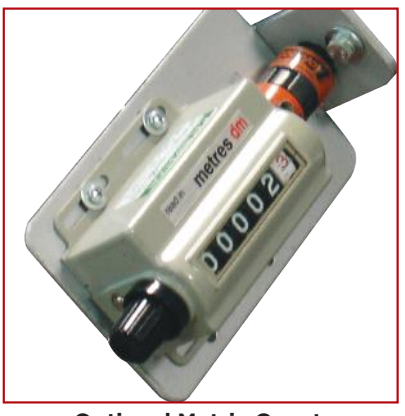
Optional Metric Counter