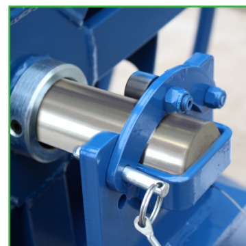
Standard Shaft Safety Locks