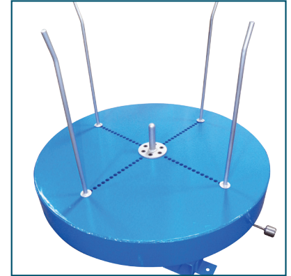
BRT5 with ID Pins and Brake