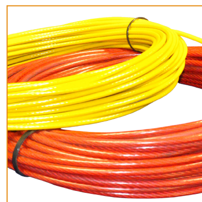
Available in Multiple Lengths to Meet Your Company's Needs