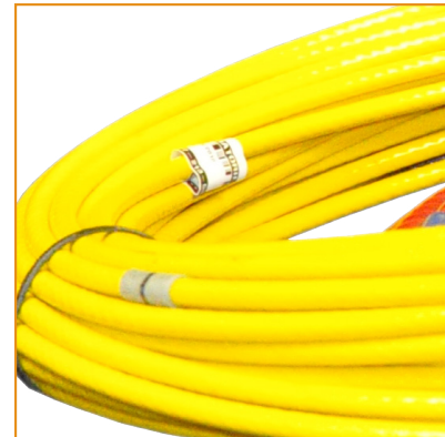
Marked at Start and Stop Points