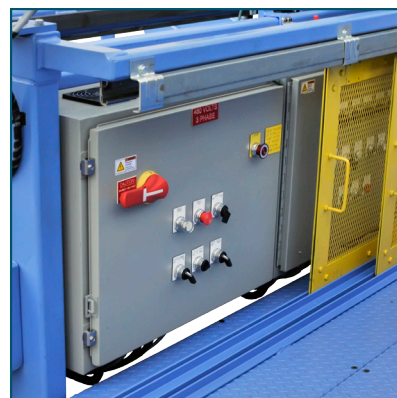
UL Approved Control Box