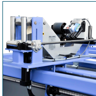
Automated Slide Traverse