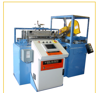
CAT 2 Capacity Chop Saw