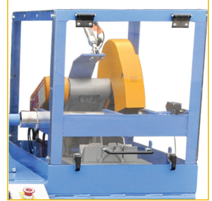
Integrated Heavy Duty Automatic Chop Saw