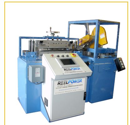
CAT 2 Capacity Chop Saw