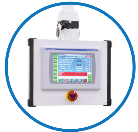
HMI CONTROL PANEL