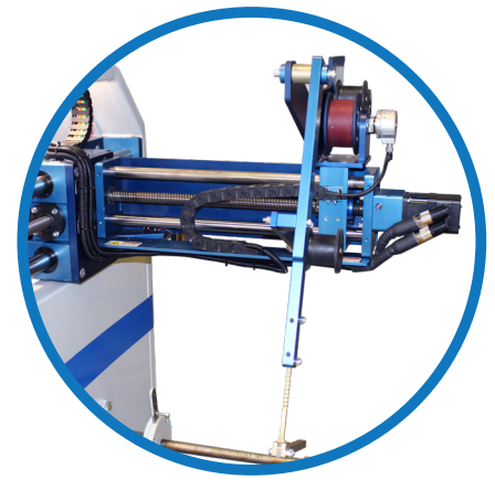
PRODUCT POSITION LAY ARM