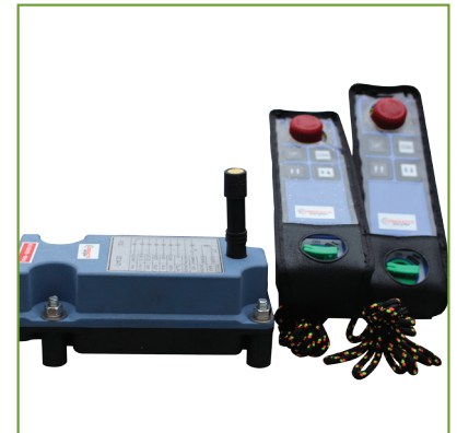
Wireless Remote Pendant