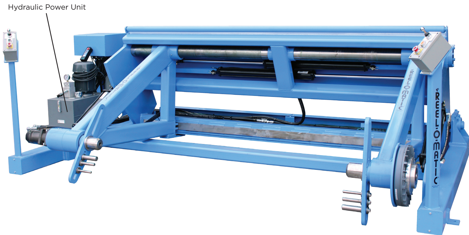
FMP15 shown above 15,000 Lb. Shaftless Pay-Out

Heavy duty floor mounted shaftless pay-outs provide you with increased productivity, reduced processing time and fast, easy supply reel change-outs.