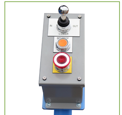
Front Mounted Control Station