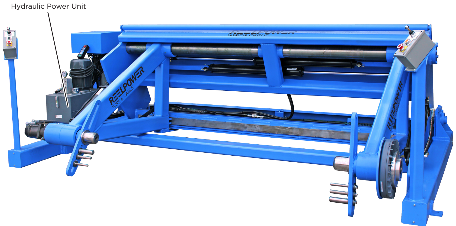
FMP15 shown above 15,000 Lb. Shaftless Pay-Out

Heavy Duty Floor Mounted Shaftless Pay-Outs provide you with increased productivity, reduced processing time and fast, easy supply reel change-outs.