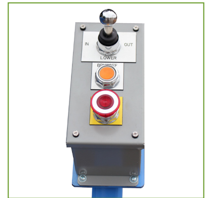
Front Mounted Control Station