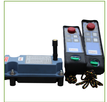
Wireless Remote Pendant