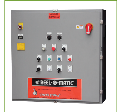
UL Panel Box