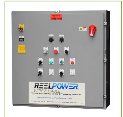
UL Panel Box