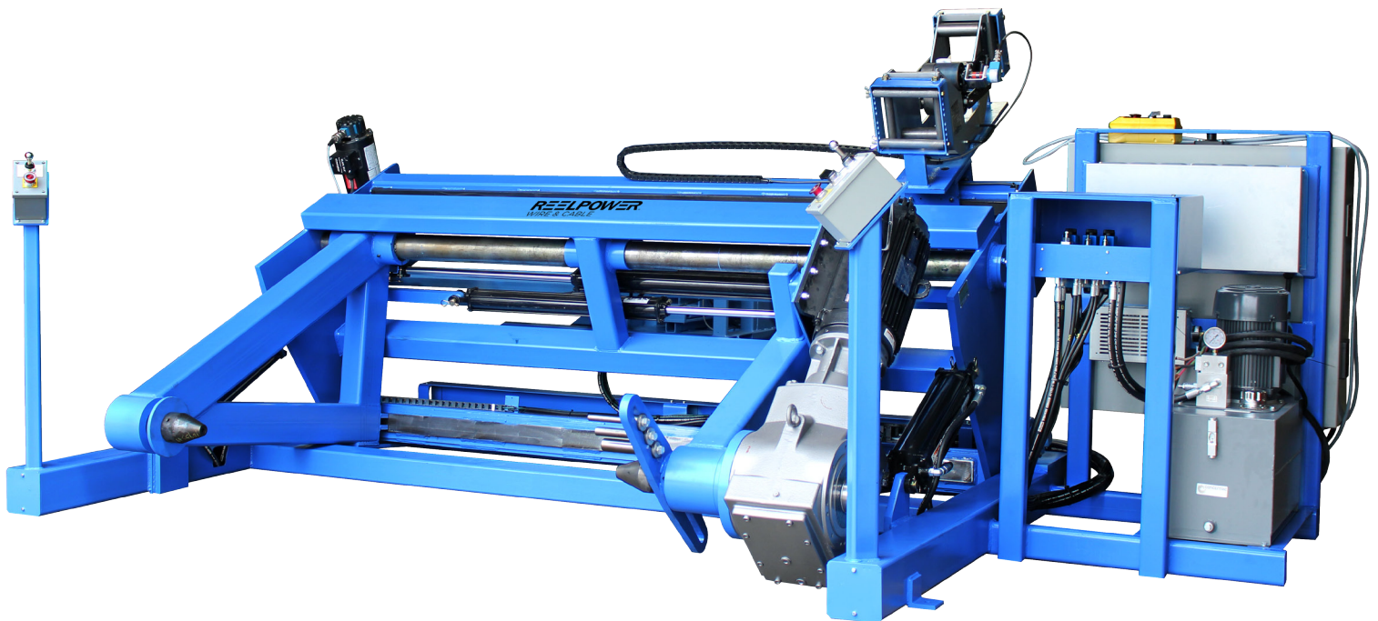
FMT10 shown above 10,000 Lb. Shaftless Take-Up

Heavy duty floor mounted shaftless take-ups provide you with improved productivity, reducing processing time.