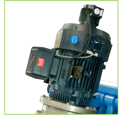
AC Vector Precision Drives