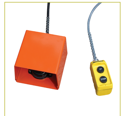
Foot Pedal & Hand-held Pendant