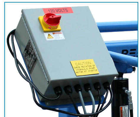
120 Volt Panel Box