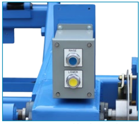
Front mounted load controls