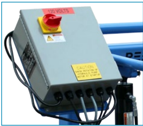
120 Volt Panel Box