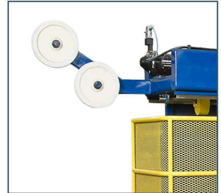
Entrance Dual Sheave Assembly for Accumulator Applications

HSDRTU-36 Shown with optional PLC controlled hydraulic reel lift/lower tables