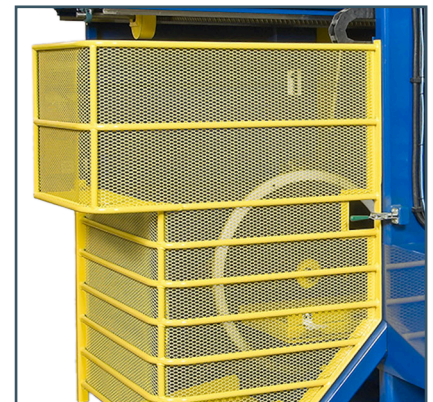
Full Sliding Door Enclosure