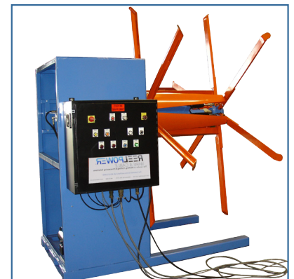
PC-500 with Power Traverse