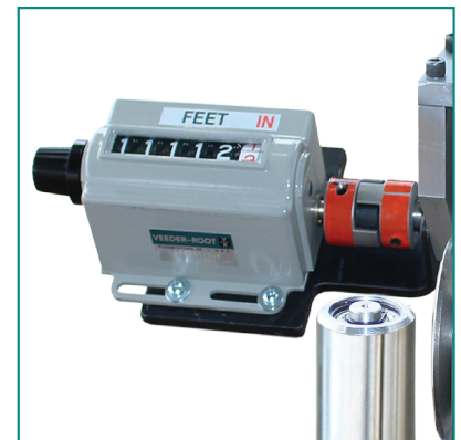
Analog Measurer Feet/Inches