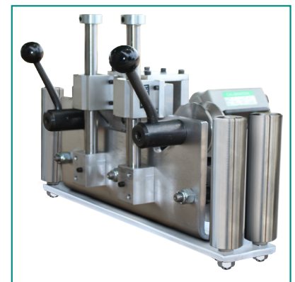
Adjustable Tensioning Guides