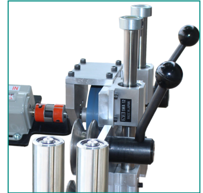
Entry & Exit Guides