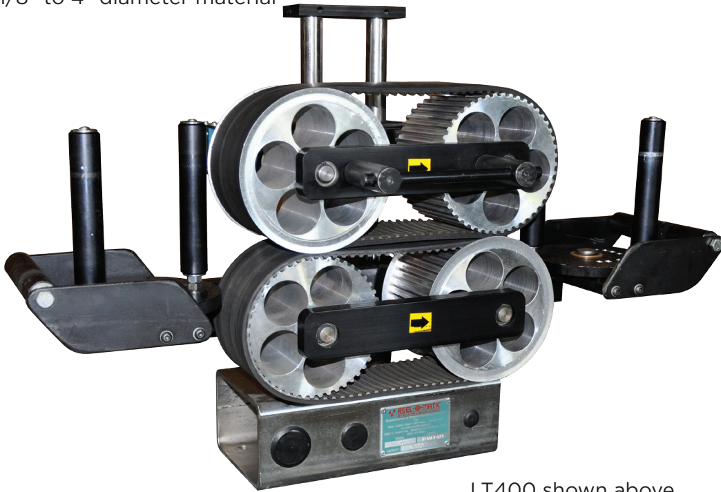
LT400 shown above