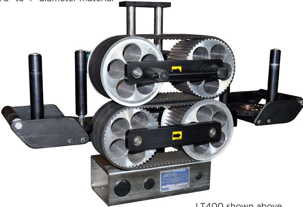
LT400 shown above