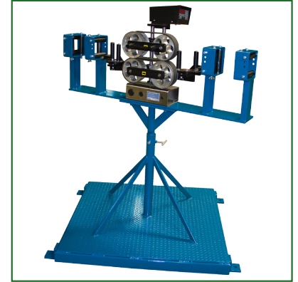
HD Telescoping Meter Stand with Extra Entry and Exit Guides