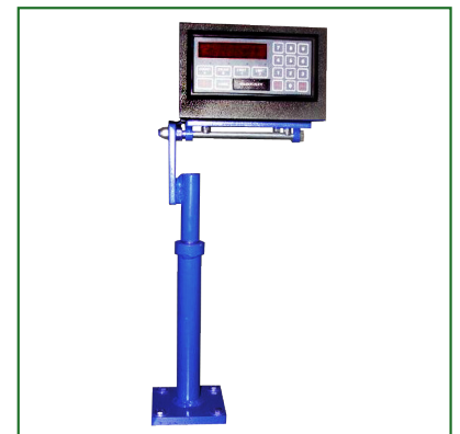
Remote Mounting Kit