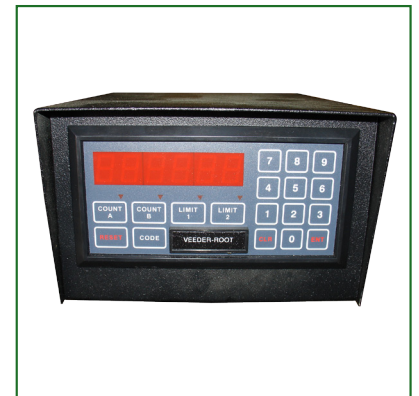
Large Display Digital Counter