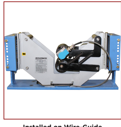
Installed on Wire-Guide with Encoder