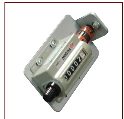
Mechanical Measurer (Imperial or Metric)