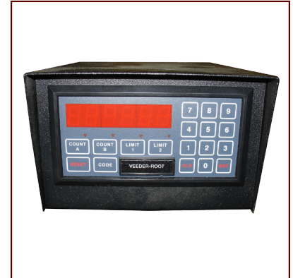
Electronic Stop-to-Length Counter