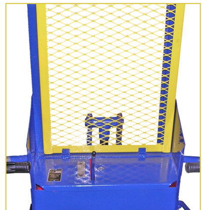
Simple "Up/Down" Control