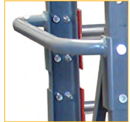
Push Handles for Steering

The Mobile Reel Rack Cart is perfect for dispersing material from reels such as: Small Gauge Wire, SJ Cord, Rubber Hose, Vinyl Hose, Metal Tubing, and other spooled products.