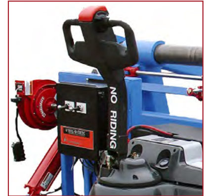
Main Control with Payoff Controls

The PRT13 doubles as a High Capacity Payoff System with options including a 16" Bronze Ventilated Disc or Electromagnetic Tension Brake System and Powered Payoff and Rewind Assist Reel Rotation.