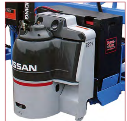
Integral Powered Mobility Feature