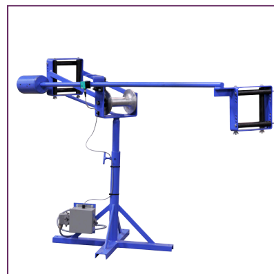
Optional Dancer Speed Control