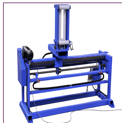
Optional Automatic Levelwind