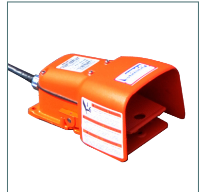
Operator Safety Foot Switch