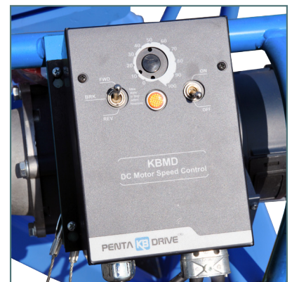
Variable Speed Drive