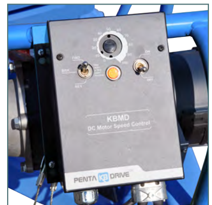
Variable Speed Drive