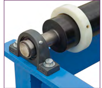
Rear Guide Collars

Consult Us About Your Special Applications.