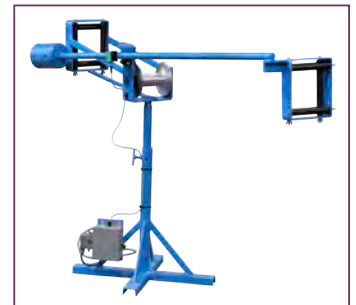
Optional Dancer Speed Control