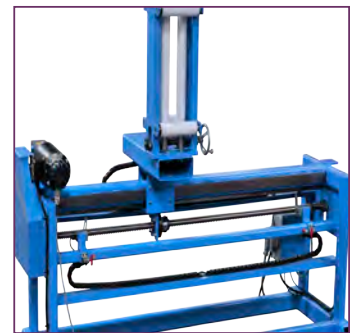
Optional Automatic Levelwind