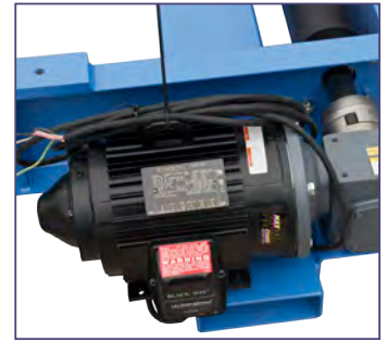
AC Variable Speed Drive