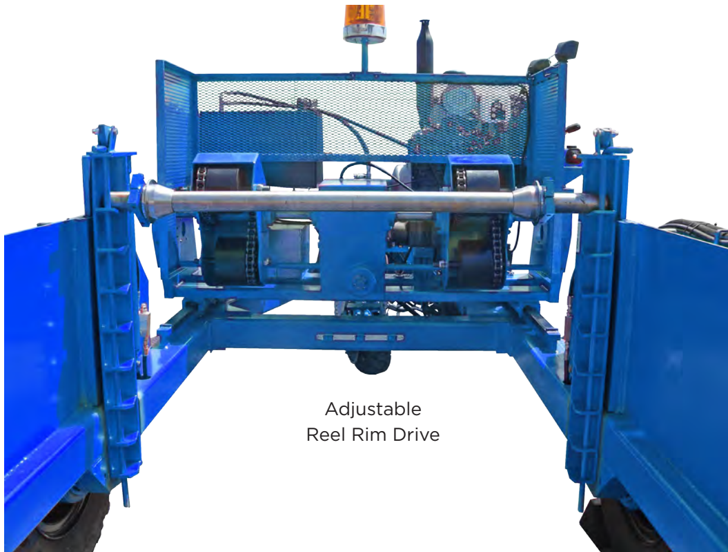
Adjustable Reel Rim Drive