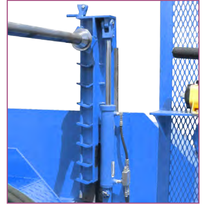
Powered Reel Lift with Multiple Shaft Pockets