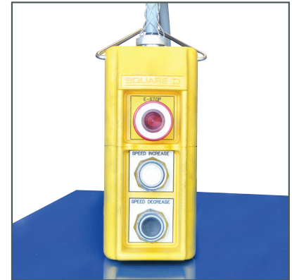
Fast/Slow Remote Pendant Control