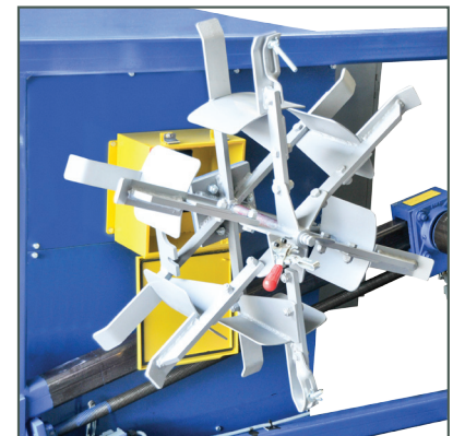
Optional Coiling Attachment