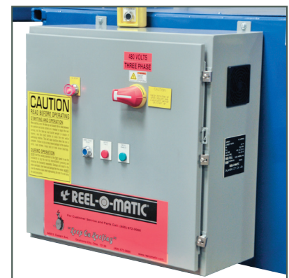
UL Certified Panel Box