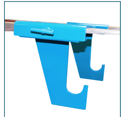
RL100 - Reel Loader & Transporter