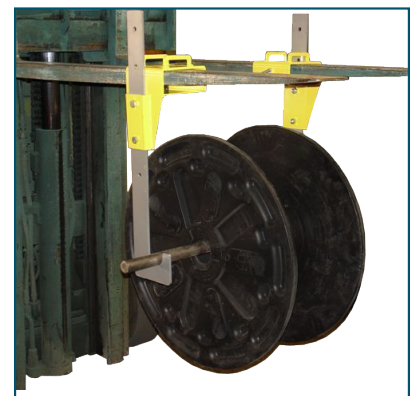
RL50 Reel Loader