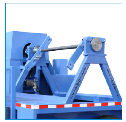
Bronze Bearing Mounted Reel Shafts