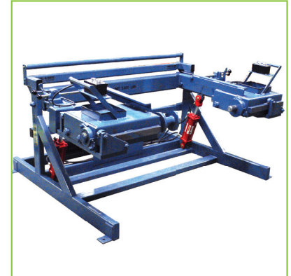
RSP5 - Shaftless Pay-Off