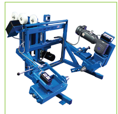
SP/RSP - Shaftless Pay-Off