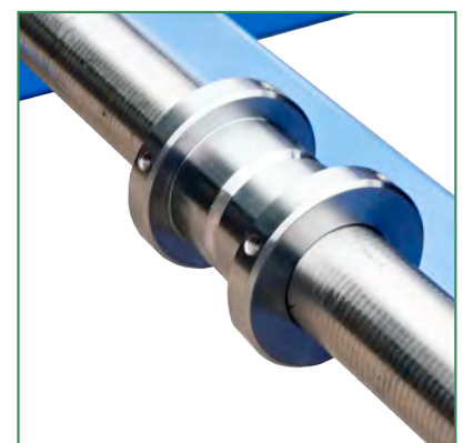
Arbor Bushings Made to Order