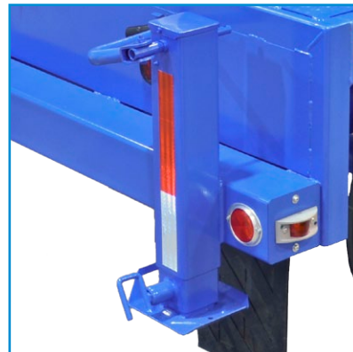
Drop Leg Stabilizing Jacks