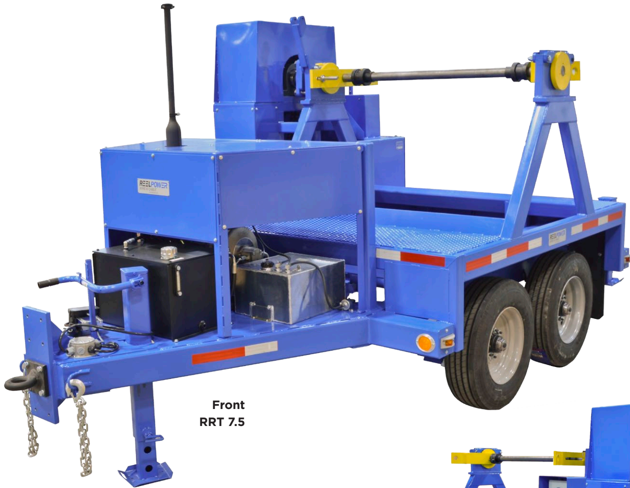
Front RRT 7.5

Trailer Mounted Re-Reeving Machinery from 5,000lb to 100,000lb capacities. Designed and manufactured for your wire rope applications.