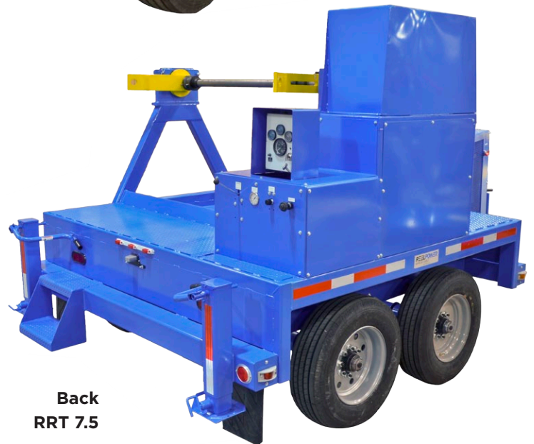
Back RRT 7.5