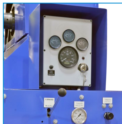
Centralized Control Panel