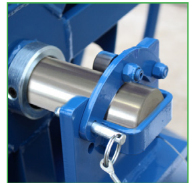
Standard Shaft Safety Locks