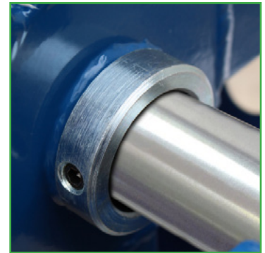
Standard 2 1/8" Locking Reel Collar