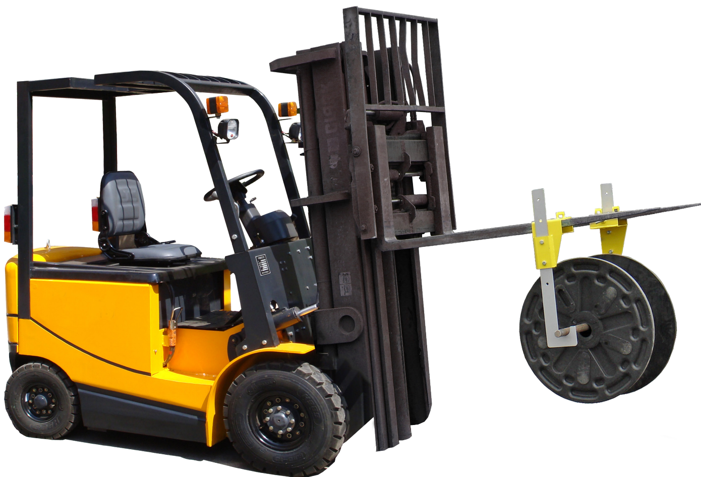
RL 50 - Reel Loader and Transporter Shown Above.

Reel-O-Matic Transports Reels Quicker, Easier, and Safer.