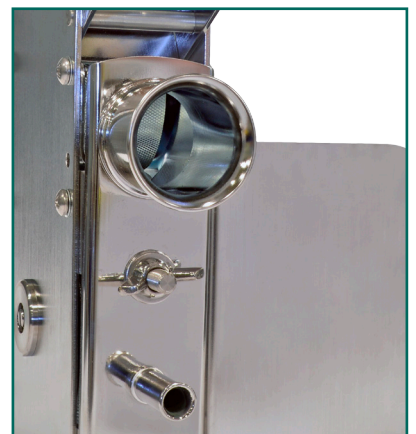
Adjustable Large & Small Material Fairlead Tube Guides