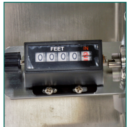
Counter Available in Feet & Inches or Meters & Decimeters