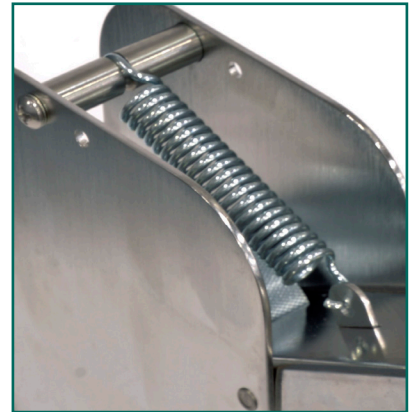
Adjustable Tension Spring Settings