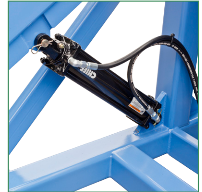
Powered Hydraulic Reel Lift