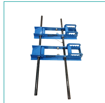
Model 600 Adjustable Reel Roller Platform