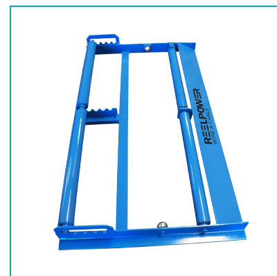
480 DW - 48" Wide * Two Reels - 24" Wide