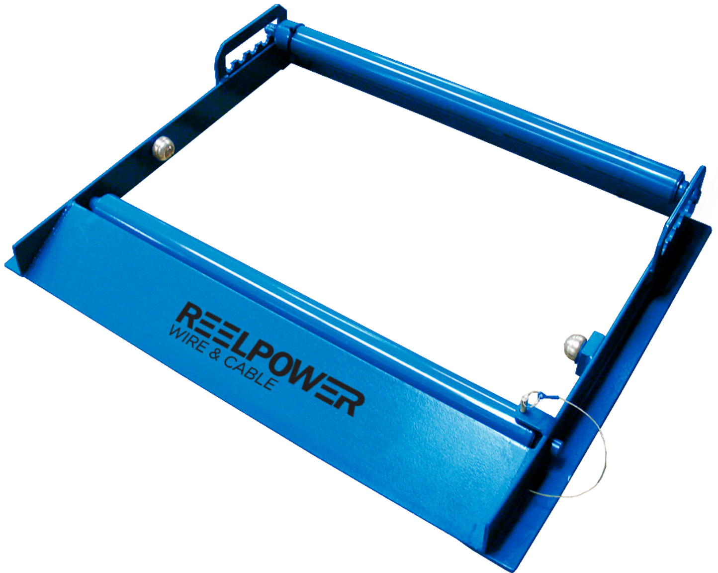
Model 280S, 300S, and 360S

Tough structural steel frame and front roller locks to ease reel removal. side rollers are Included. Low base design to avoid damaging of cable inside reel. Rugged steel “angle” construction with steel plate ramp.