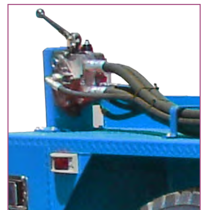
Rear Loading Controls