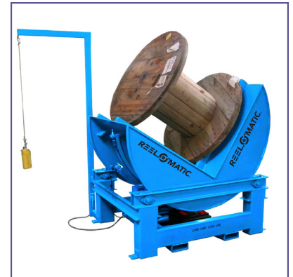
Custom Designed RU10