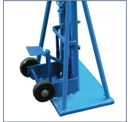
Foot Operated Hydraulic Jack

Shaft saddles may be set for a number of vertical positions so that a minimum of foot pedal “jacking” is required.