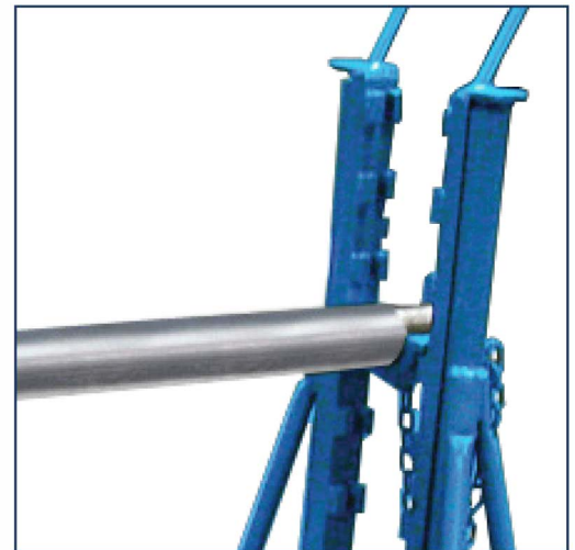
Adjustable Shaft Saddle