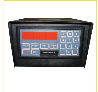
Electronic Stop to Length Counter