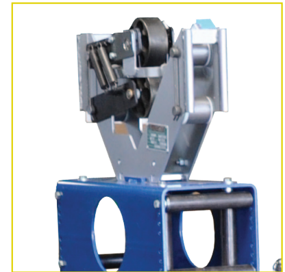
Model 1700SP Meter and Guide Box