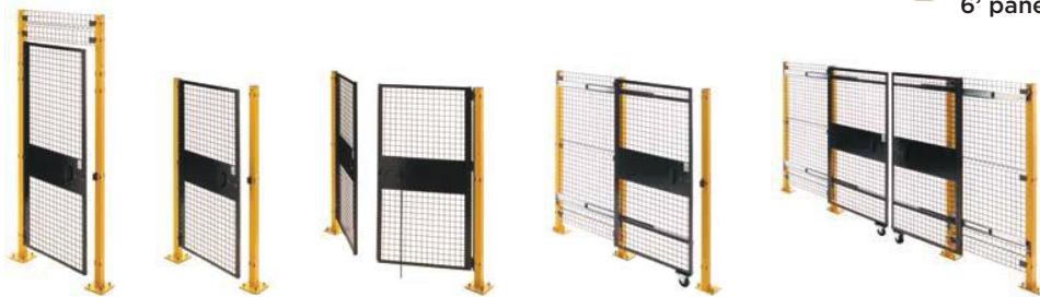
8' swing door | 6' swing door | Double swing door | Single sliding door | Double sliding door