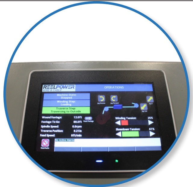
PLC/HMI Digital Controls