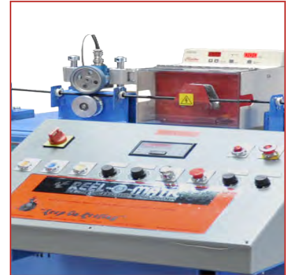
Clinton Spark Tester