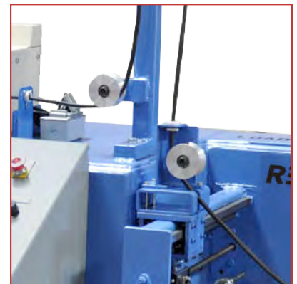
Automatic Take-Up Levelwind